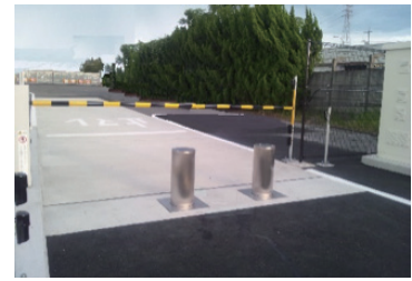
Intrusion prevention system Rising Bollard "ONI"

Auto CAD 3 units, Withstand Voltage Tester 1 unit, Insulation Resistance Tester 1 unit, Power High Tester 1 unit, Soldering Device 20 units, Crimping Tool 30 etc.