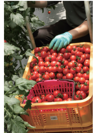
Our farm for research and development