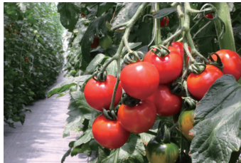
Tomatoes grown by using our software