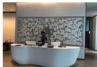
5star hotel, check-in counter by Keisoukun