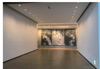
5star hotel, Lobby area, right & left wall are made in Keisoukun

Same functions and features as Keisoukun™ Plaster