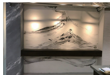
Art wall by Keisoukun