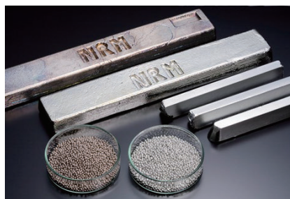
Low-melting Point Alloys and Granneles