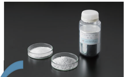
Gallium and Gallium Oxide