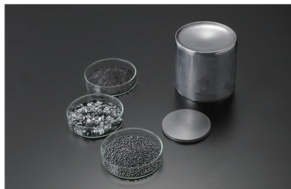
Selenium ingot and granules