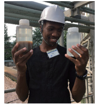
Untreated Water & Treated Water