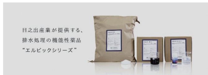
production and sales of agents for effluent treatment ELBIC SERIES