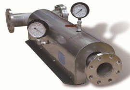
Hinodesangyo Microbubbler™, (HMB) a proprietary microbubble generator developed by Hinodesangyo Co., Ltd., Japan