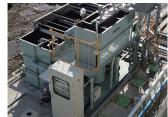
Planning design and construction of effluent-treatment facilities & Dispersible microbial Process