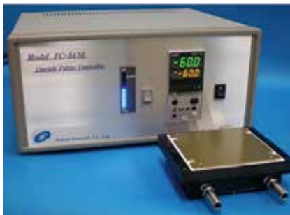
(Ultra low temperature plate) (Range ; -60 to +145°C) (Required utility is 100V only)

[Awards], [Joint research and development], [Production equipment], [Factory]