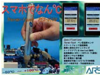
(Pen shaped temperature sensor) (Use with smartphone)