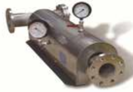
Hinodesangyo Microbubbler™ (HMB) a proprietary microbubbler generator developed by Hinodesangyo Co., Ltd., Japan