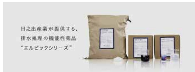
production and sales of agents for effluent treatment ELBIC SERIES