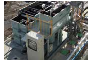
Planning design and construction of effluent-treatment facilities & Dispersible microbial Process