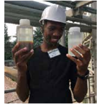
untreatment water & treatment water